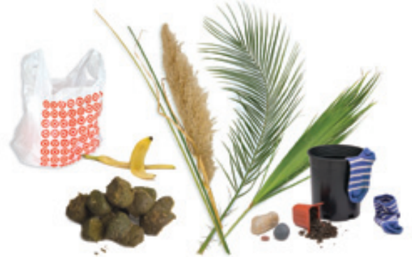
NO Palm fronds, pampas grass, food, animal waste, plastic bags, nursery pots, dirt, rocks or smelly socks!