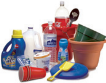
ALL PLASTIC (Todo Plástico) Now including plastic bags! NO Styrofoam or packing peanuts.

To learn more, visit: www.lessismore.org | County of Santa Barbara | (805) 882.3600