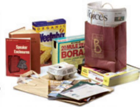
PAPER & CARDBOARD (Papel y Cartón) NO paper plates, towels, napkins. NO waxed boxes.