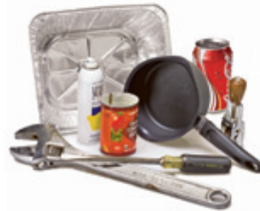
ALL METAL (Todo Metal) NO full or partly-full containers. NO oil filters.