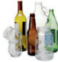
GLASS BOTTLES & JARS (Botellas y Tarros de Vidrio) NO window glass or drinking glasses.