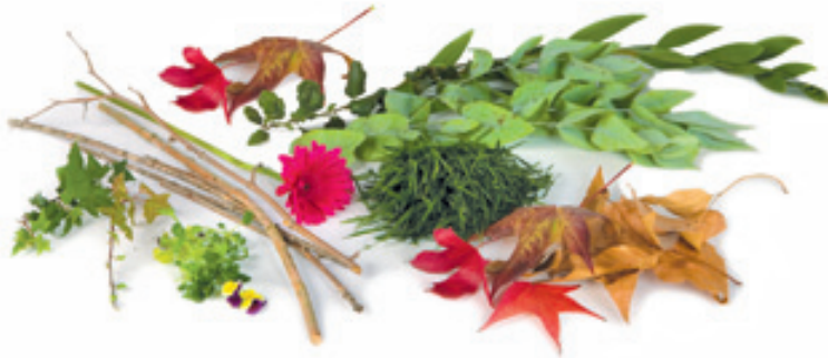
YES Grass, leaves, flowers, yard trimmings, ivy, plants and small branches.

As a reminder, the following are DO's and DO NOT's for your green waste containers: